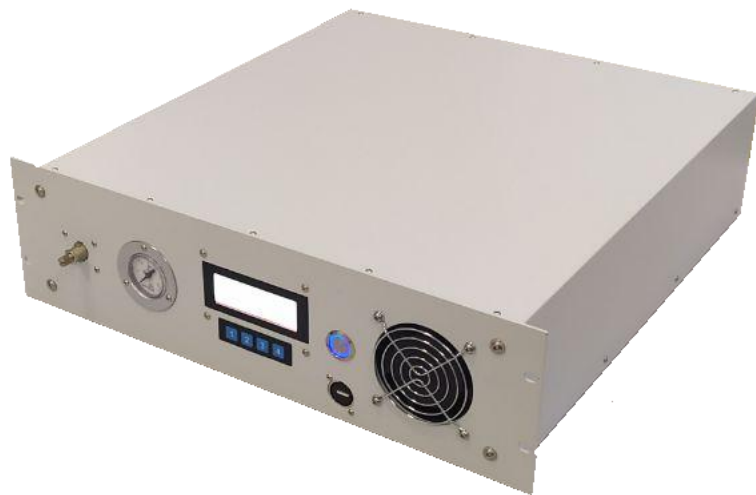
Air Dehumidifier and Purifier Unit ADPU60L-4.x, front panel

ADPU60L-4.x is designed in a standard 19-inch case. The system is connected to optical and laser devices using one-touch fittings.