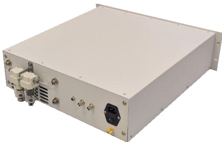
Air Dehumidifier and Purifier Unit ADPU60L-4.x, back panel