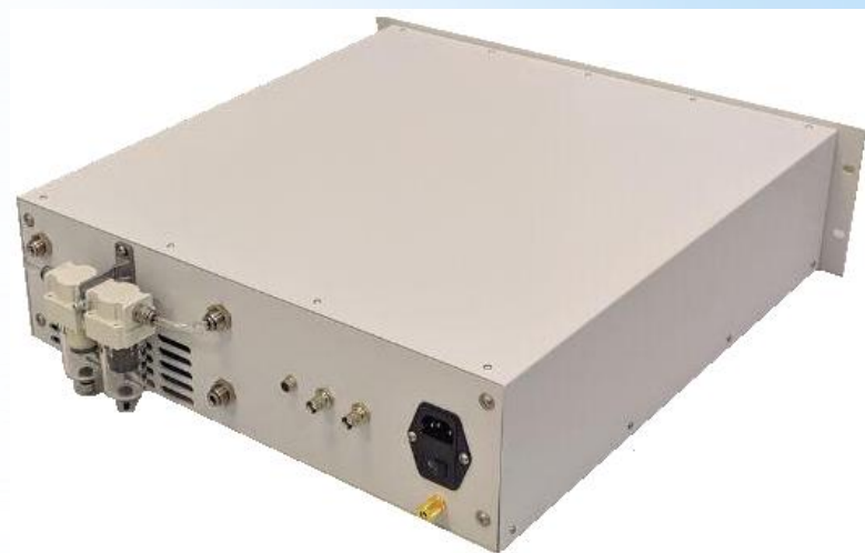
Air Dehumidifier and Purifier Unit ADPU60L-4.x, back panel