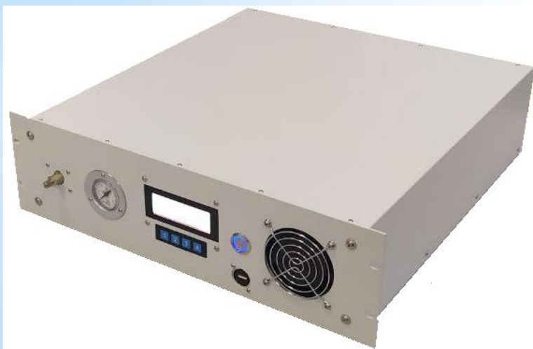
Air Dehumidifier and Purifier Unit ADPU60L-4.x, front panel

ADPU60L-4.x is designed in a standard 19-inch case. The system is connected to optical and laser devices using one-touch fittings.